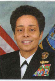
Admiral Michelle Howard '82's, USN (Ret.), career has seen her become the first woman to command a Navy ship and the first Black woman to achieve the rank of four-star admiral. Now retired, Howard traveled to Spokane, WA, to deliver the keynote address at the annual Young Women's Christian Association's (YWCA) Women of Achievement Luncheon on 24 March. The event highlighted six women who shine in their respective fields and serve Spokane, WA.

Admiral Michelle Howard '82's, USN (Ret.), career has seen her become the first woman to command a Navy ship and the first Black woman to achieve the rank of four-star admiral. Now retired, Howard traveled to Spokane, WA, to deliver the keynote address at the annual Young Women's Christian Association's (YWCA) Women of Achievement Luncheon on 24 March. The event highlighted six women who shine in their respective fields and serve Spokane, WA.